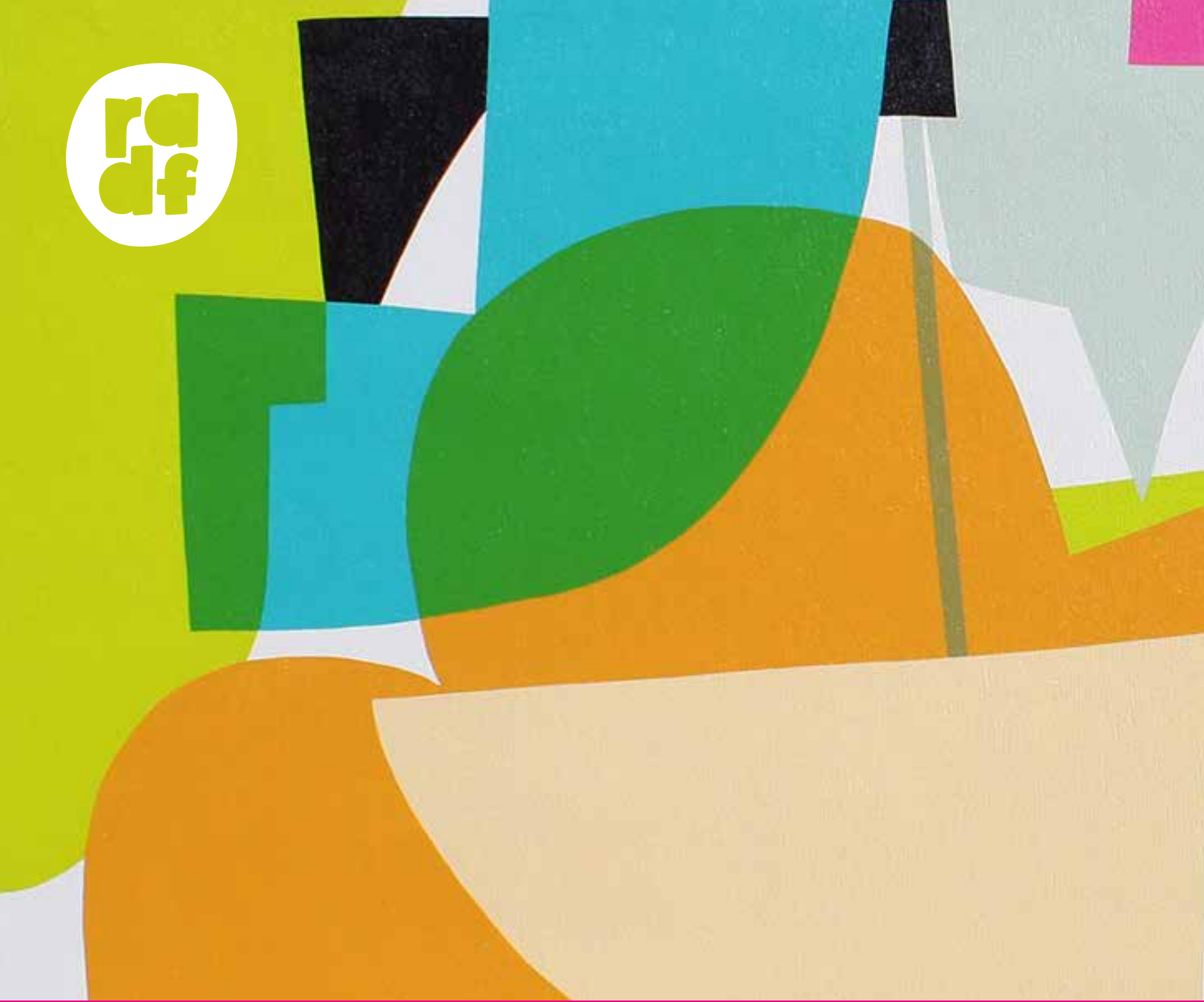
Cover image: Simon Degroot, Build, Connect, Grow , 2017, Bundaberg Regional Art Gallery Carpark.