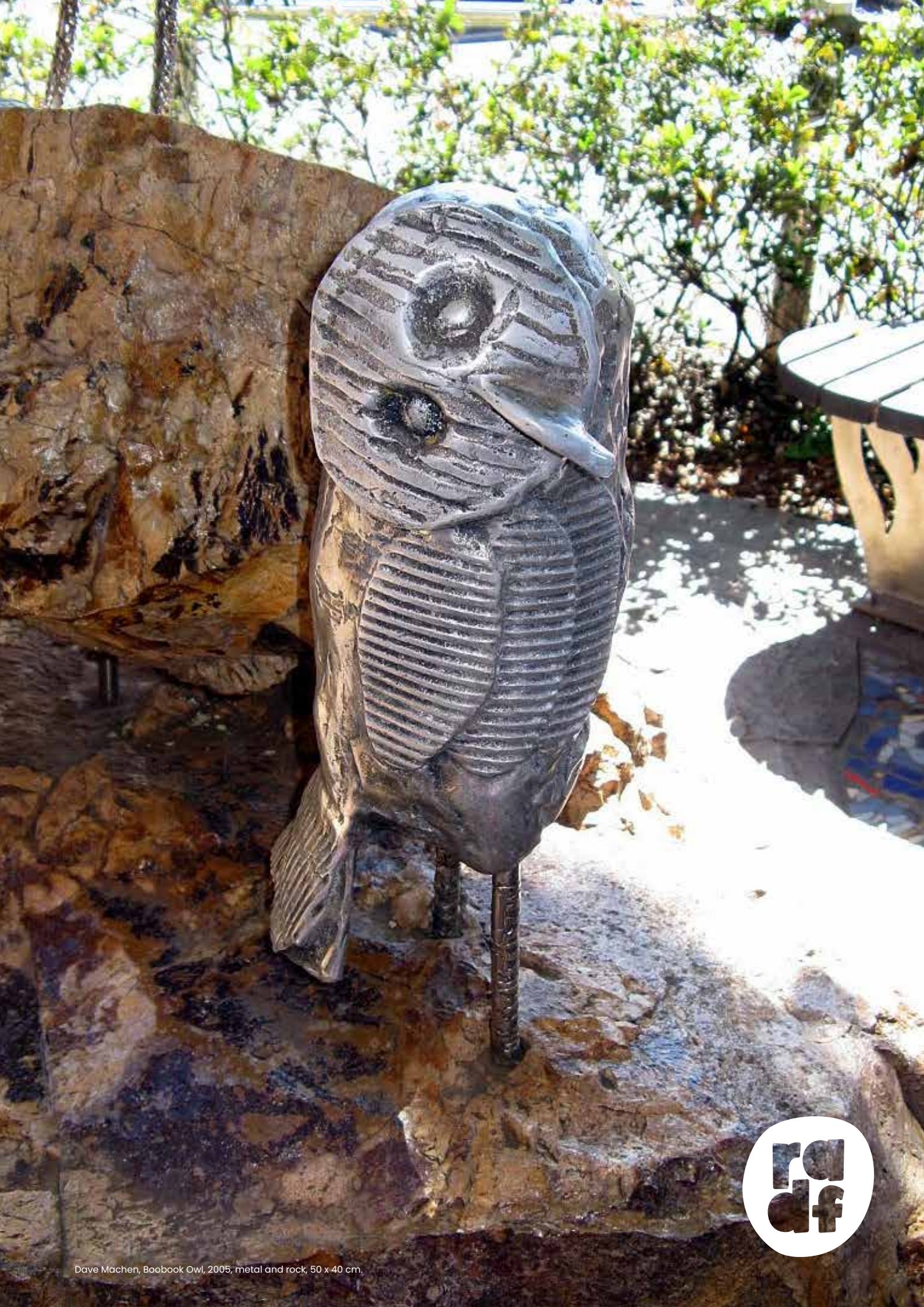
Dave Machen, Boobook Owl, 2005, metal and rock, 50 x 40 cm.