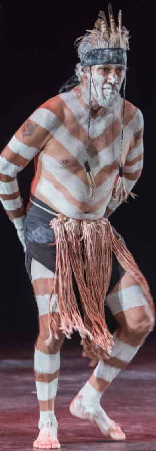
Cultural Performers, Warrior Descendants , NAIDOC Week Concert, Moncrieff Entertainment Centre, 2018.