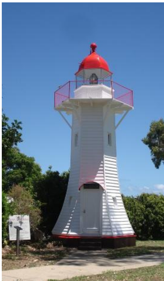
Old Lighthouse in current Burnett Heads location, Dec 2009.