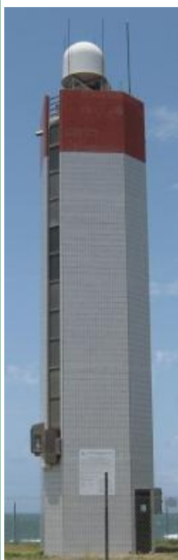
The New Lighthouse, 29 Nov 2009

The Old (Historic) Burnett Heads Lighthouse is a very valuable part of our history. It played a vital role in ensuring the safety of ships and their cargoes, crews and passengers. It also made certain Bundaberg was accessible to marine traffic which in turn helped our economy and society grow and prosper. The efforts of those involved in preserving the lighthouse should be very gratefully acknowledged.