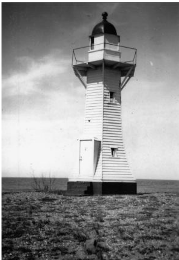
Old Lighthouse in original Burnett Heads (South Head) location, date unknown.