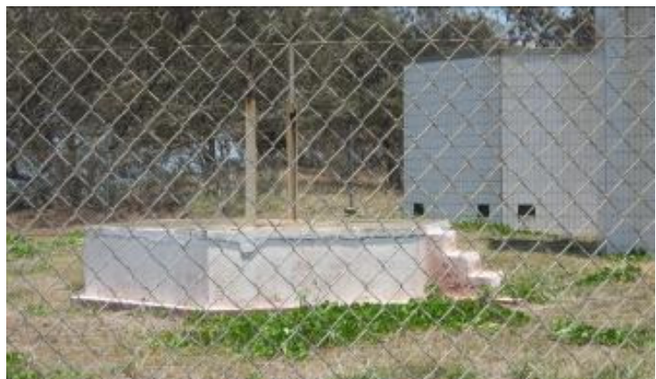
Old Lighthouse Base - next to new lighthouse. (P. Browne)

They also inspected the old lighthouse, for which Mr Millen (Milne) brought the key. It was found to be in good condition and had new flooring and recently restored foundations. It was decided that the acetylene burner and prisms would be removed from the old lighthouse as they were not original parts, and that the Department would supply old style lights more in keeping with the period the lighthouse was originally built.