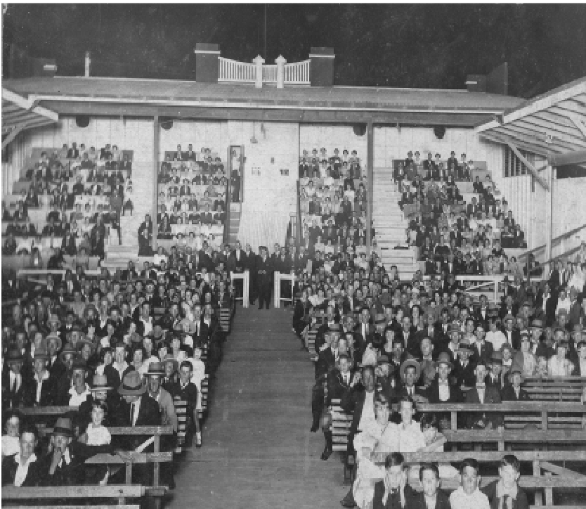
Interior of the Paramount Theatre while it was an open air cinema, 1926

Marre and Turner extensively refurbished the theatre and opened a couple of days before the finishing touches were added. The screen was situated at the northern end and terraces of seats and steps rose back towards Bourbong Street. More terraced seating was provided on either side of the theatre, and patrons could also choose to take advantage of seats on the concrete floor. All up the Paramount could hold around 3000 people. 13 The orchestra (these were the days before 'talkies') was housed in an enclosure in the centre of the seating at the Bourbong Street end of the theatre. 14