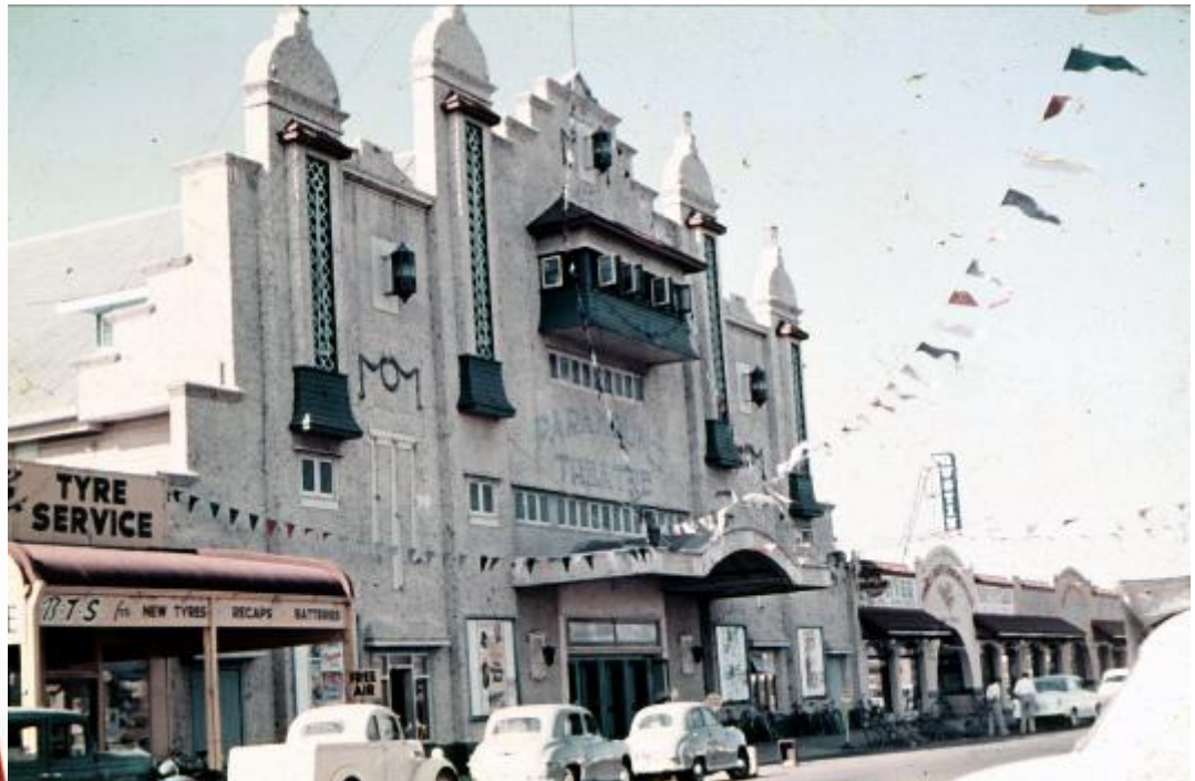
Paramount Theatre, [no date], c1950s