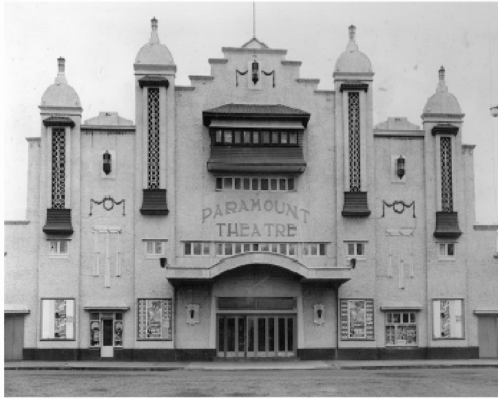
Paramount Theatre, 1930 Picture Bundaberg Collection: bun01218