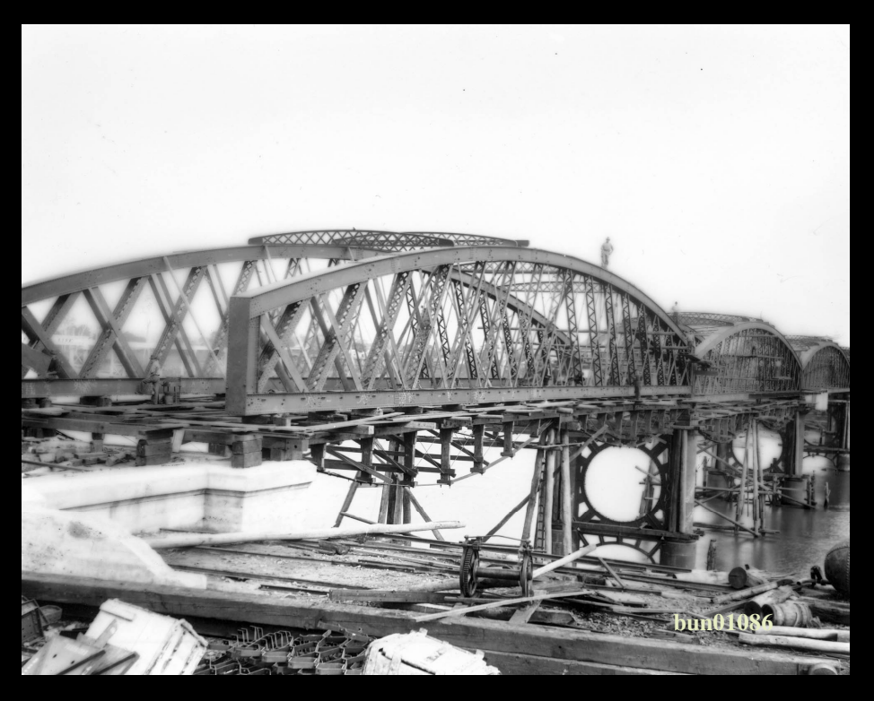
Early 1900—The bridge nears completion—built at an estimated cost of £200,000, residents originally wanted to call it Steuart Bridge, or Watson Bridge.