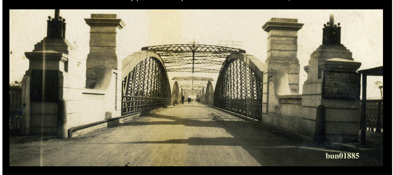
The Burnett Traffic Bridge opened on August 24, 1900, with a public holiday for local residents. Queensland Governor Lord Lambert officially opened the bridge, with Premier Robert Philp were in attendance.