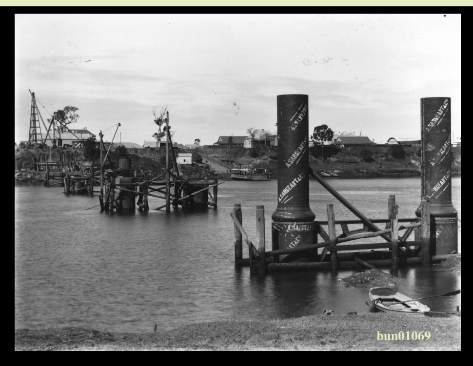
Ca 1898—Construction of the Burnett River Bridge begins—it will be the longest steel traffic bridge in Australia on completion.