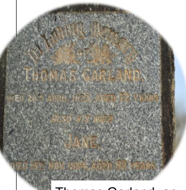
Thomas Garland, an early undertaker

The Bundaberg Lawn Cemetery is situated immediately beside the Bundaberg General Cemetery. The first burial was reportedly on 18 December 1965.<sup>2</sup> The lawn cemetery is, as its name suggests, an area where all the graves are covered in lawn, with a plaque at the head of the grave. By contrast the General Cemetery is a monumental cemetery. The graves have monuments up to 2 metres or so high and are often fully covered over, usually in concrete or marble. They may also have a fence surrounding them.<sup>24,25</sup>