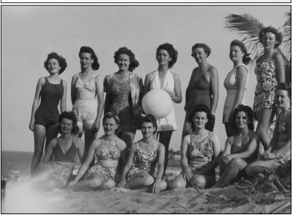
bun00495 WAF girls at Nielson Park 1945