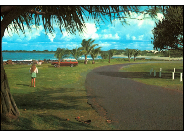
Top-Bottom: bun01343 - Surf lifesavers at Nielson Park 1957, bun0285 Crowds at Nielson Park beach ca1960s, bun01851 Postcard of Bargara Hotel ca1970, bun01339 Bathing huts and car park at Nielson Park 1957, bun01852 Kellys Beach and Lagoon ca1970, bun00972 Postcard of Nielson Park beach, bun01338 Nielson Park beach, bun01853 Postcard of Basin and picnic area at Kelly's Beach ca1970.