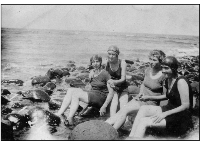
bun 02981 Girls at the beach at Sandhills ca 1918