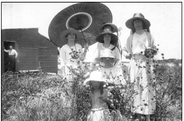
bun00824 Group of women in front of bathing hut at Sandhills 1919