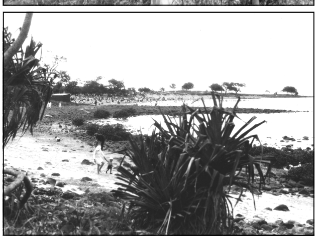
bun02711 Nielson Park beach