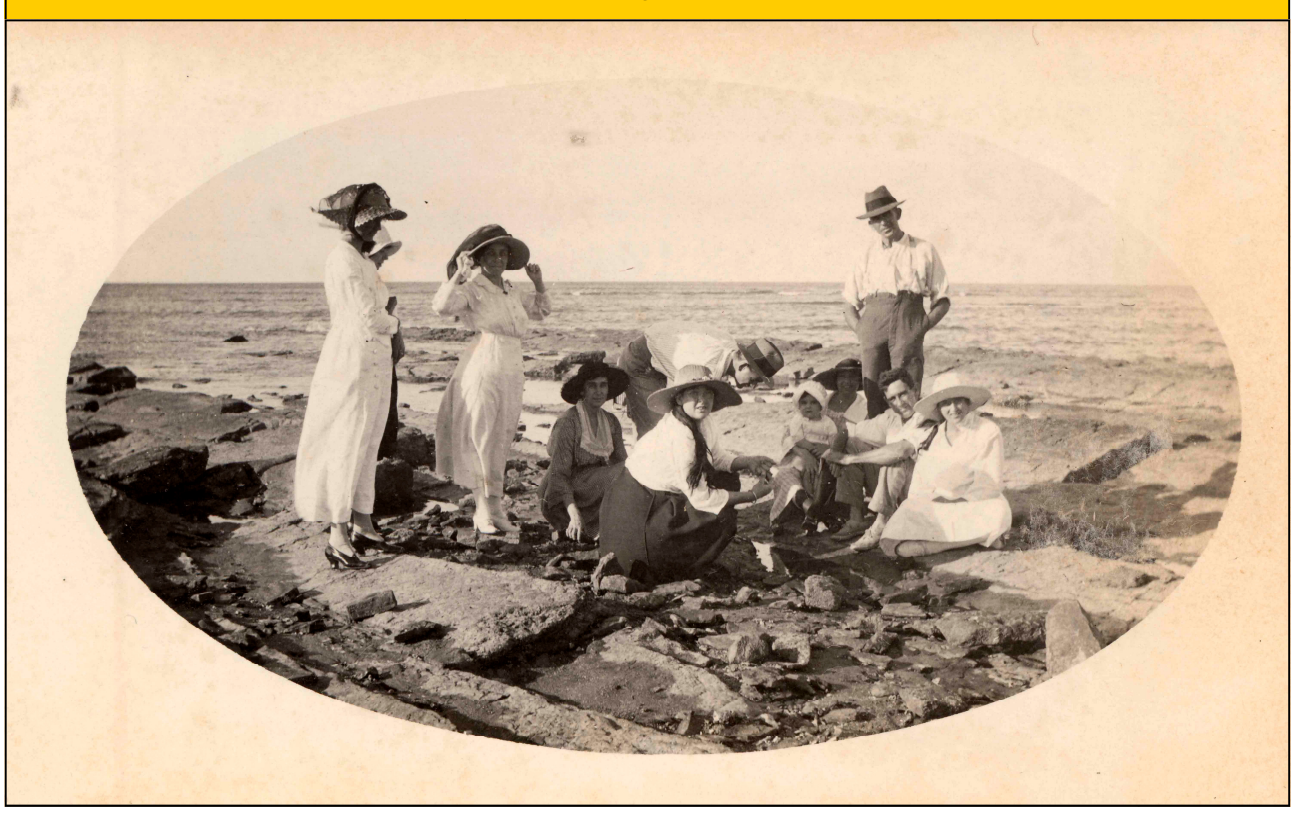
bun 00822 On the beach at Sandhills ca 1900

1 Since early settlement, Sandhills, or Bargara, has always been a popular 2 destination. The beaches have remained the same, although buildings have come and gone.